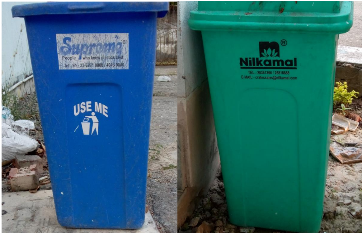
For Non Biodegradable Waste

Facilities for segregation of Bio-degradable and Non bio-degradable waste for composting.